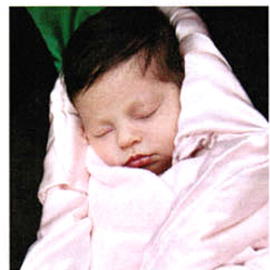
"These early stages of being a newborn are so great," Samantha says.