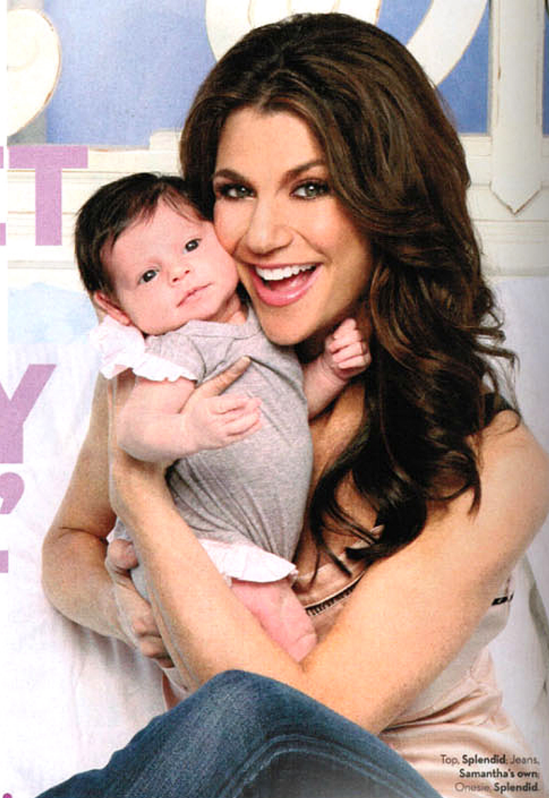
Top, Splendid; Jeans, Samantha's own; Onesie, Splendid.