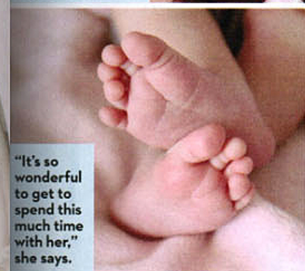
"It's so wonderful to get to spend this much time with her," she says.